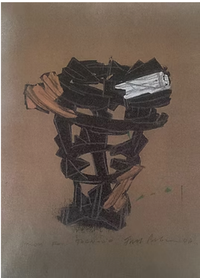
STUDY FOR ROUND N' ROUND II 2007 Mixed media on paper 9 1/2 x 8 inches