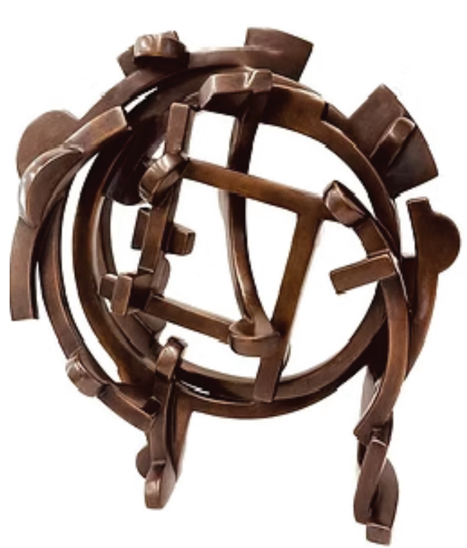
KID CHOCOLATE III 2023 Cast Bronze 14 x 13 x 5 inches