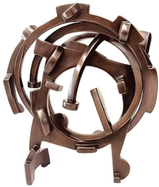
KID CHOCOLATE II 2023 Cast Bronze 14 x 13 x 5 inches