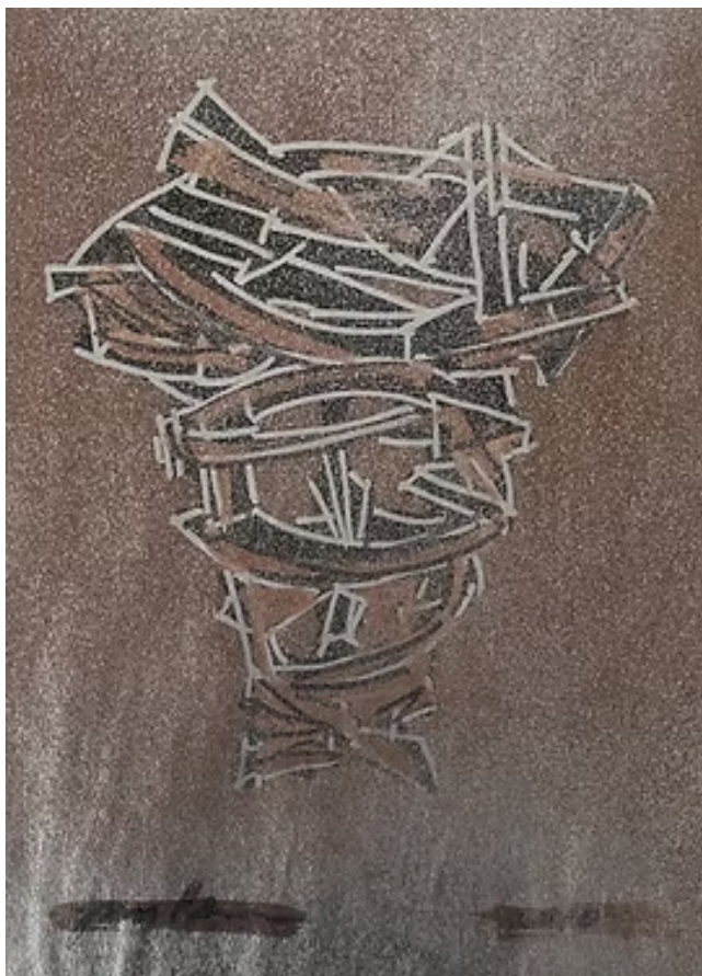
STUDY FOR ROUND N' ROUND I 2007 Mixed media on paper 9 1/2 x 8 inches