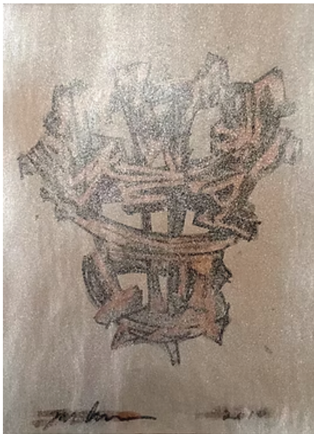
STUDY FOR ROUND N' ROUND III 2007 Mixed media on paper 9 1/2 x 8 inches